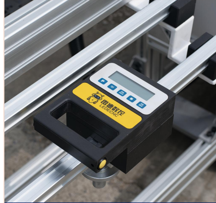
Wireless Measurement Organization